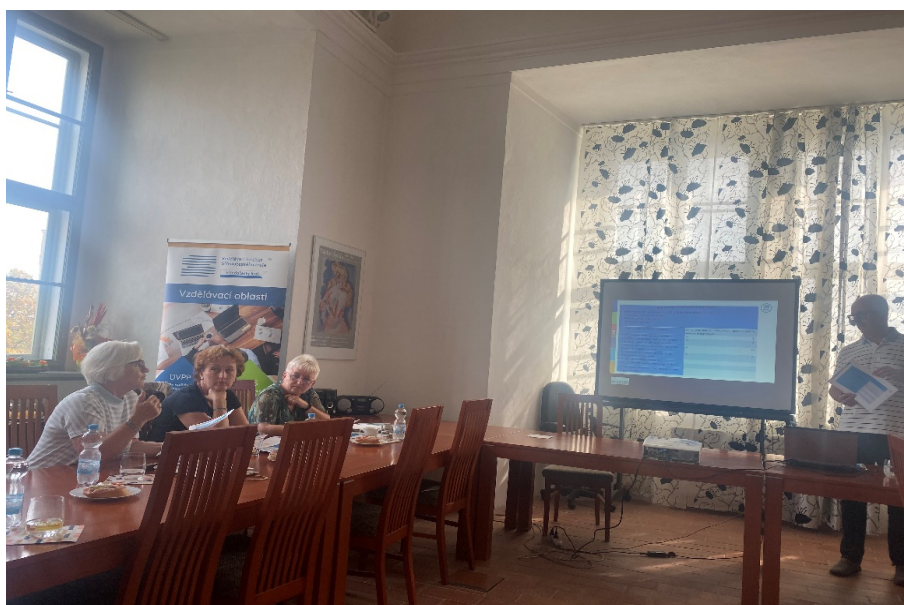
4 Transnational meeting in Kutná Hora 15. 9. 2021