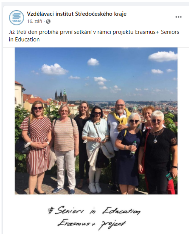
3 Transnational meeting in Prague (Facebook) 14. 9. 2021