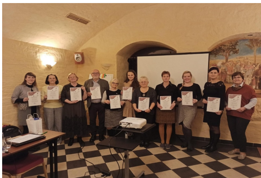
7 Staff training in Kaunas 12. 11. 2021