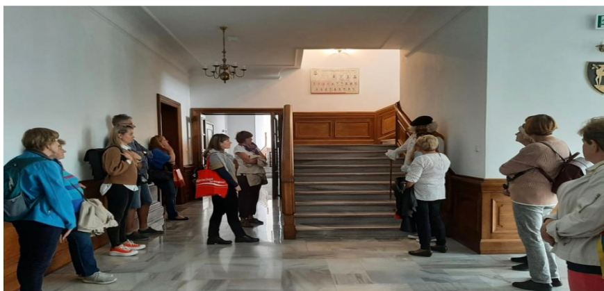
5 Blended mobility in Jelenia Gora (Facebook) 27. 9. 2021