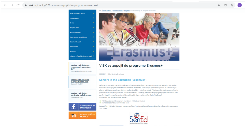
2 Dissemination of project SenEd Erasmus+ (VSK website) 5. 2. 2021